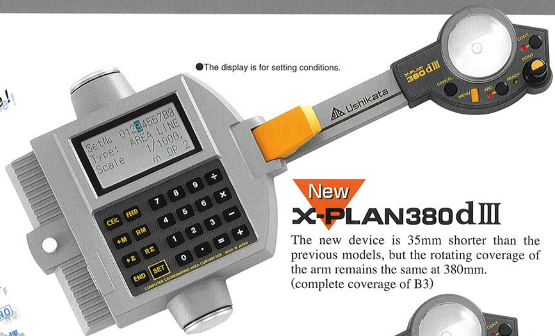
●The display is for setting conditions.