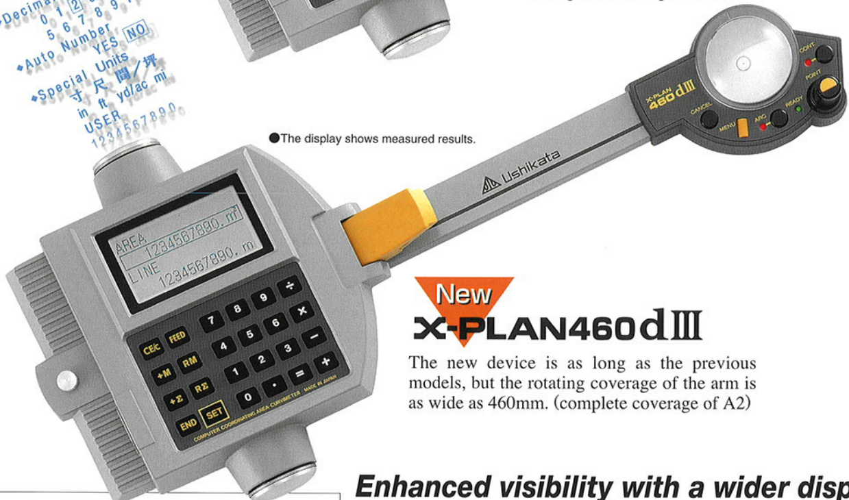
●The display shows measured results.

The new device is 35mm shorter than the previous models, but the rotating coverage of the arm remains the same at 380mm. (complete coverage of B3)